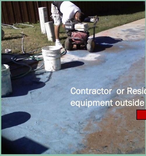
Contractor or Resident washing equipment outside