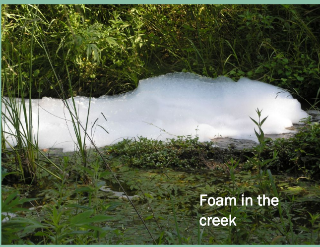
Foam in the creek