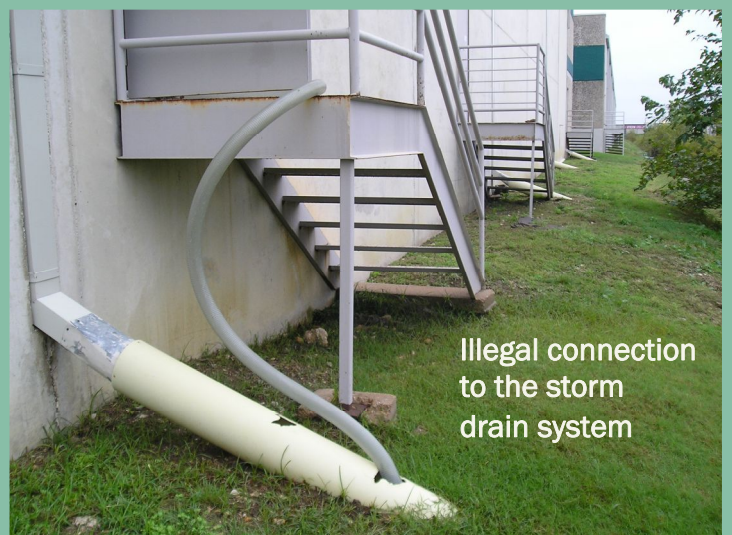
Illegal connection to the storm drain system