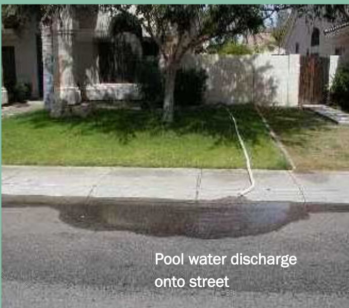
Pool water discharge onto street