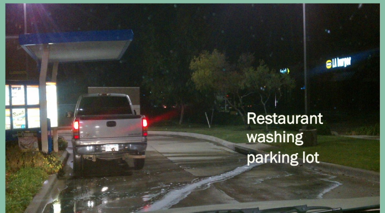
Restaurant washing parking lot