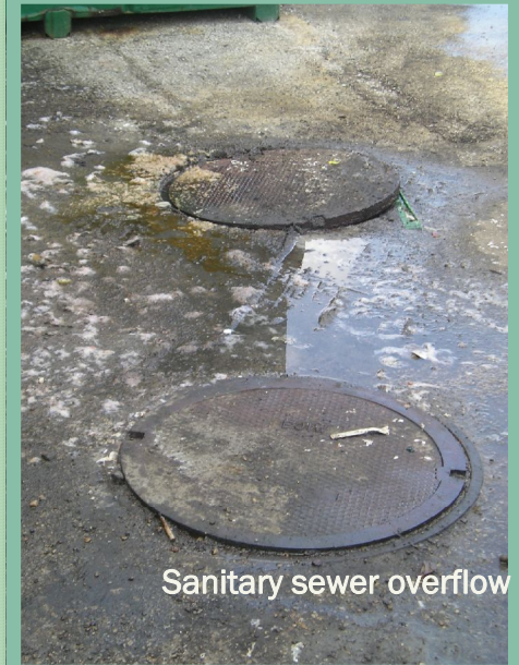
Sanitary sewer overflow